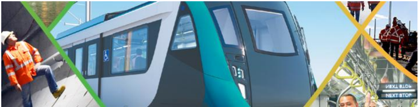
The Australian Cost Engineering Society (ACES) Newsletter Issue VOLUME 1, JANUARY 2018

Welcome to our 1st ever ACES NSW newsletter a new and improved way of collaborating and informing our members of Society developments, events, local news and updates.