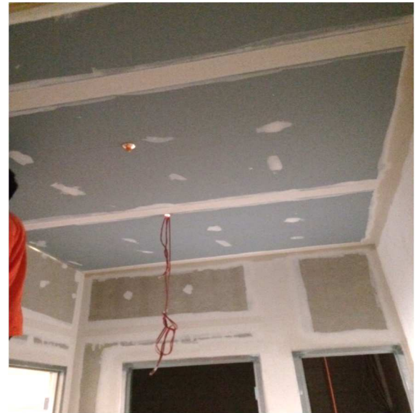
Variation: Ceiling installation had to be held for the mechanical services re-design and execution of the re-designed mechanical services in Levels 2-5 of an educational building in NSW