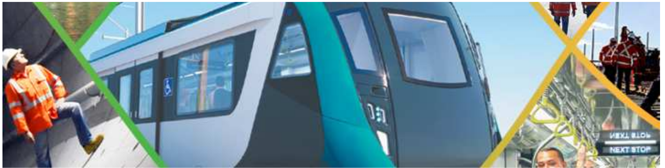
The Australian Cost Engineering Society (ACES) Newsletter Issue VOLUME 2, APRIL 2018

Welcome to our 2nd edition Newsletter of 2018, as mentioned this year is shaping up to be a busy year for ACES with lots happening across our NSW and other regional chapters. We have already held our 1 st Technical event in February which showcased one of the more modern techniques being used in delivering projects, Augmented and Virtual Reality brings projects to life to maximise collaboration and control. The turnout was great at this event, more details are within this edition. Other information includes updates on the remainder of the Program for 2018 including further Technical Events, Conferences and Networking events as well as the imminent new website launch.