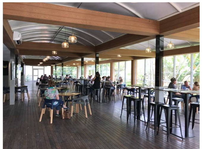
Restaurant Refurbishment and Fit-out including demolition of existing walls, entrance doors, bar and toilet amenities (Approx. 400 sq.m. in QLD)