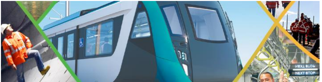
The Australian Cost Engineering Society (ACES) Newsletter Issue VOLUME 3, August 2018

Welcome to our 3rd Newsletter edition of 2018. Over the winter period ACES have maintained our momentum with a number of key developments and events being held across NSW as well as nationally.